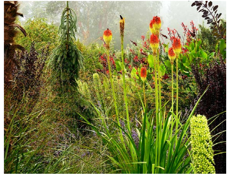
Dan Hinkley's garden, Windcliff

Bainbridge Island is our destination via