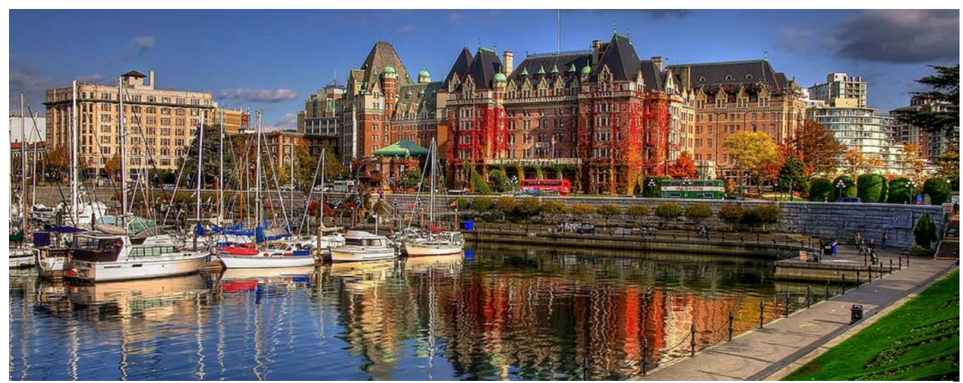
Victoria, British Columbia Harbor