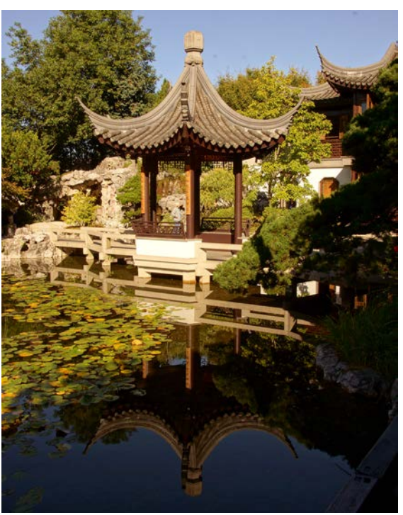
Lan Su Chinese Garden in Portland

TreeWalk, a new addition to the garden. Afterward, we enjoy the beautiful Nitobe Memorial Garden, a traditional Japanese Tea and Stroll Garden, considered to be one of the most authentic Japanese gardens in North America. Lodging: Vancouver (B)