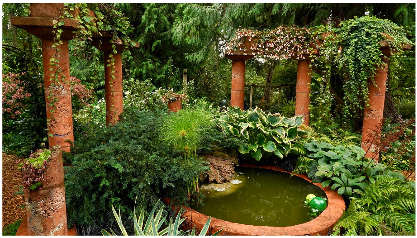
Private garden in Seattle

Today brings to a close our journey through the gardens of Oregon, Washington, and British Columbia. We make our way (on our own) back to Chicago. (B)