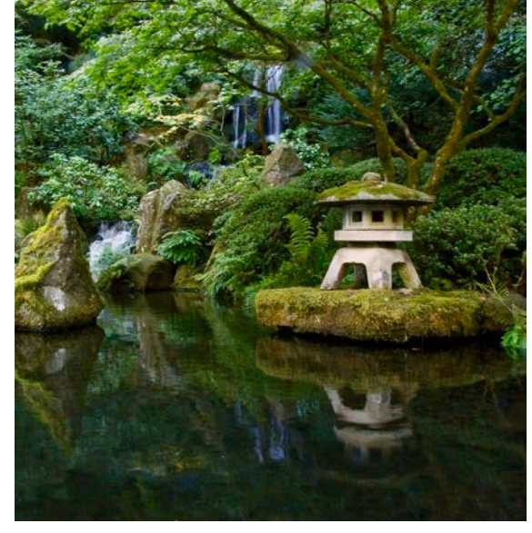
Portland Japanese Garden

begins with a visit to the International Rose Test Garden where we have some time on our own to 'smell the roses' and enjoy this excellent collection of roses from all over the world. Conceived in 1915, this garden was a safe haven for European hybrid roses during World War I. Afterward, we have a guided tour of the beautiful Portland Japanese Garden. Begun in 1963, the garden represents the strong connection between the people of Portland and the country of Japan. Next, we make our way to see the Columbia River Gorge and the magnificent Multnomah Falls, before returning to enjoy a get-acquainted dinner at McMenimin's Edgefield Restaurant. Lodging: Portland (B)(D)