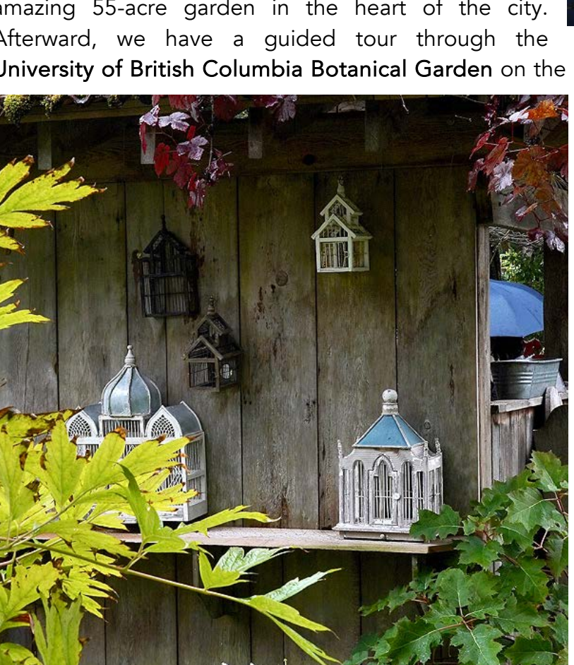
Private garden outside Vancouver

University of British Columbia Botanical Garden on the campus of UBC. We explore the new