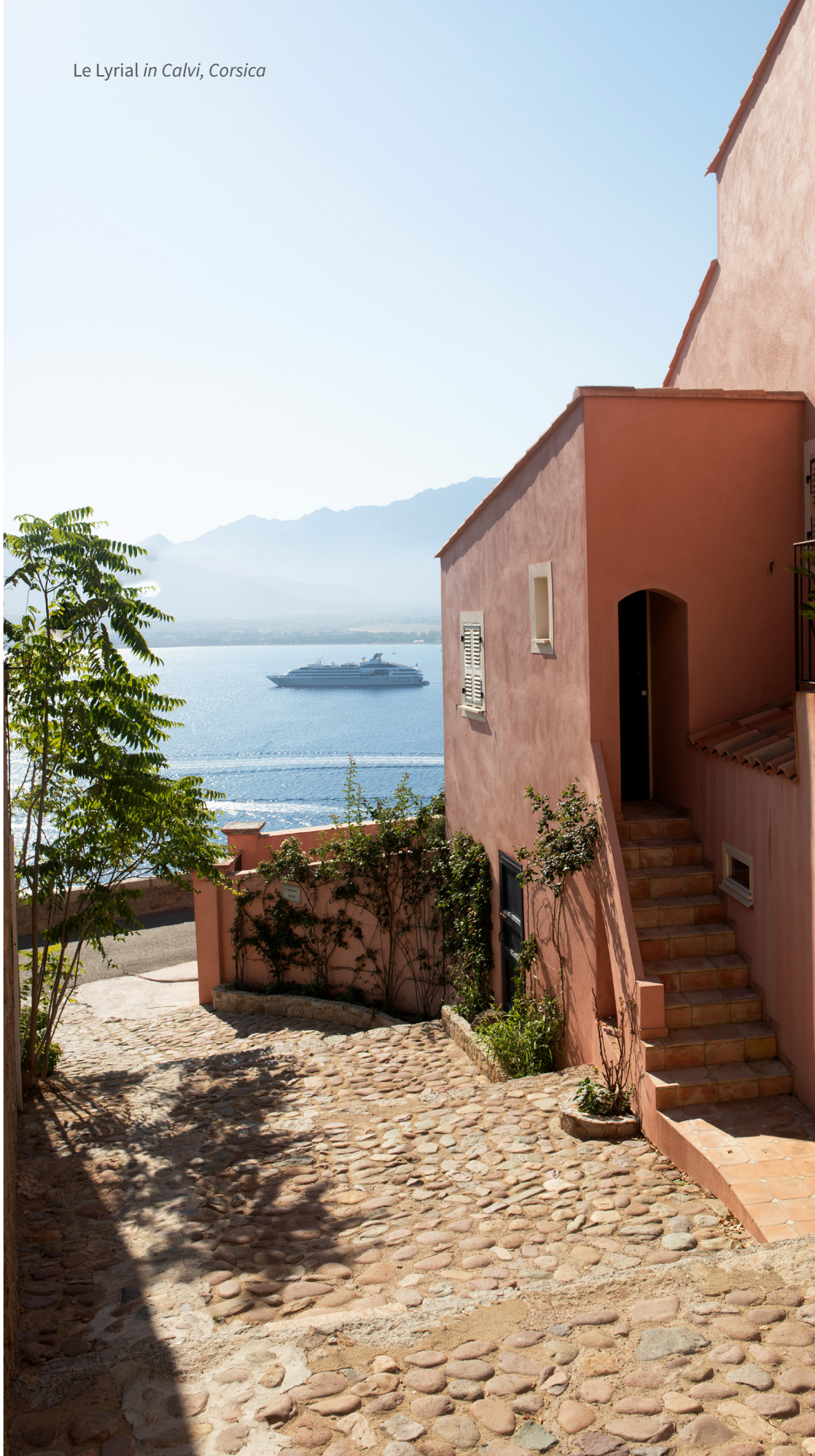
Le Lyrial in Calvi, Corsica