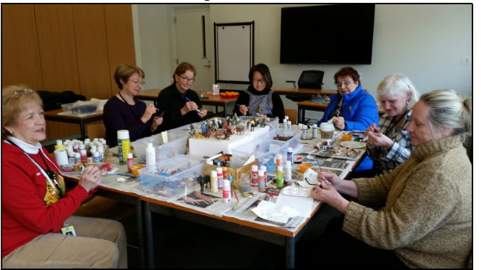
Volunteers Painting the Railroad Exhibit figurines