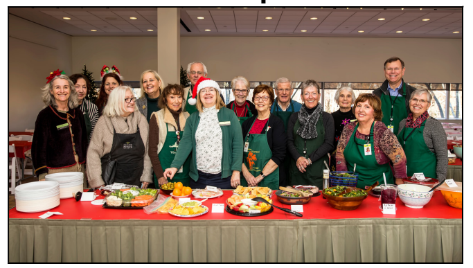
Volunteer Holiday Potluck