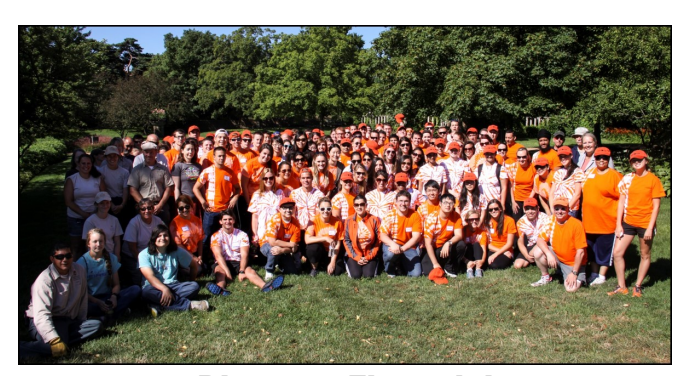
Discover Financial Corporate Volunteer Day