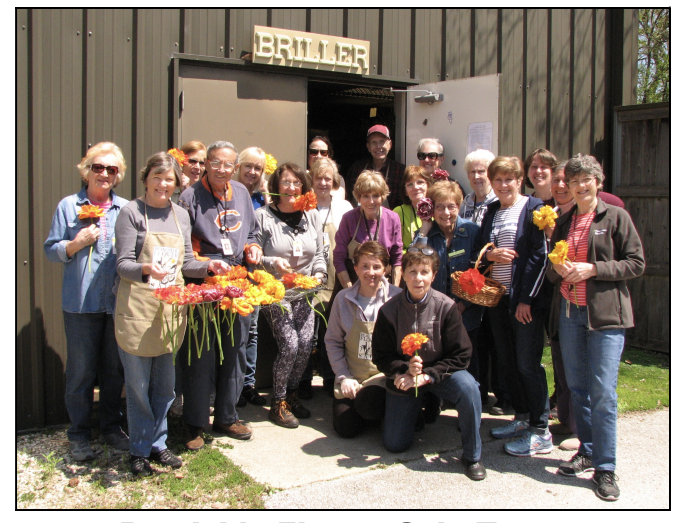
Roadside Flower Sale Team