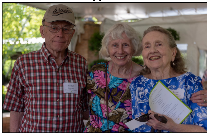
Reception Honoring Volunteers and Staff 20+ years of service