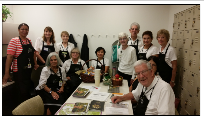
American Craft Expo volunteers