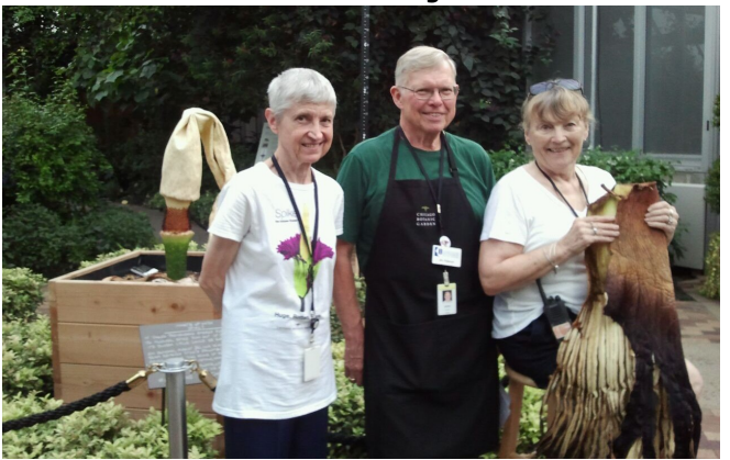
Corpse Flower Fun