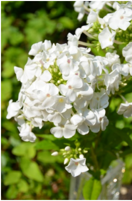
David garden phlox Phlox paniculata 'David'

Summer is at its peak, and you will find many popular flowers in bloom now that would have been familiar to European and Asian settlers, such as daylilies, hostas, lilies, rose-of-Sharon and waterlilies. But it's also the season for our native American species to shine. The yellow daisy flowers of compass plants in the prairie tower over wild bergamot, mountain mint, Culver's root and nodding onions. Other native perennials that stand tall include sunflowers, Joe pye weed, big bluestem, compass plant and tall coreopsis. In garden displays look for "nativars", cultivated selections of native wildflowers. 'Annabelle' and the newer Incrediball® types of hydrangeas are derived from the wild hydrangea of eastern North America. We have many nativars of purple coneflower, black-eyed Susans, rose mallow, phlox, sunflowers and obedient plant on display. Enjoy a colorful summer walk at the Chicago Botanic Garden.