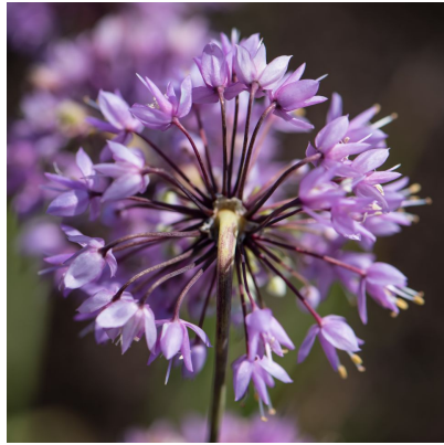
Wine Drop nodding onion Allium cernuum 'Wine Drop'