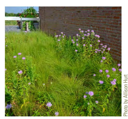
Sporobolus heterolepis and Monarda fistulosa

The green roof gardens were designed by OVS to be decorative and dynamic, which is especially evident in the numerous plant combinations. While not every pairing was successful, a good number of the combinations provided a succession of bloom as well as strong textural counterparts. Among the most successful plant combinations were Solidago 'Wichita Mountains' and Calamagrostis brachytricha; Calamintha nepeta ssp. nepeta and Perovskia atriplicifolia; Solidago rigida, Salvia azurea var. grandiflora, and Andropogon gerardii; Phlox subulata 'Snowflake' and 'Apple Blossom'; Coreopsis lanceolata and Helianthus mollis; Artemisia ludoviciana var.