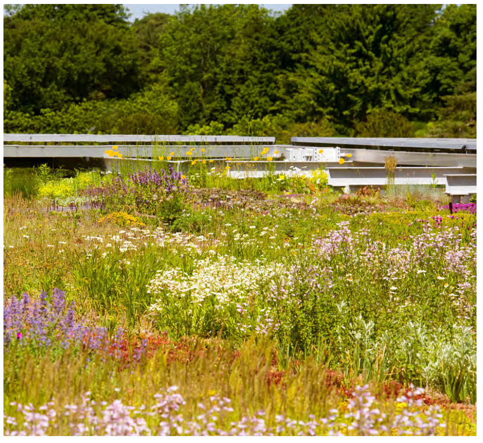
North green roof display beds

The north green roof features native and nonnative plants, as well as a variety of sedums ( Sedum spp.) planted in three linear ribbons that bisect the roof from east to west. The sedum plantings are meant to draw the eye across the roof using color, texture, and form to create the feeling of movement, and to act as an experimental control, since sedums are the workhorses on extensive green roofs. The intersection of the curved and straight lines creates a compartmentalized effect, giving the north