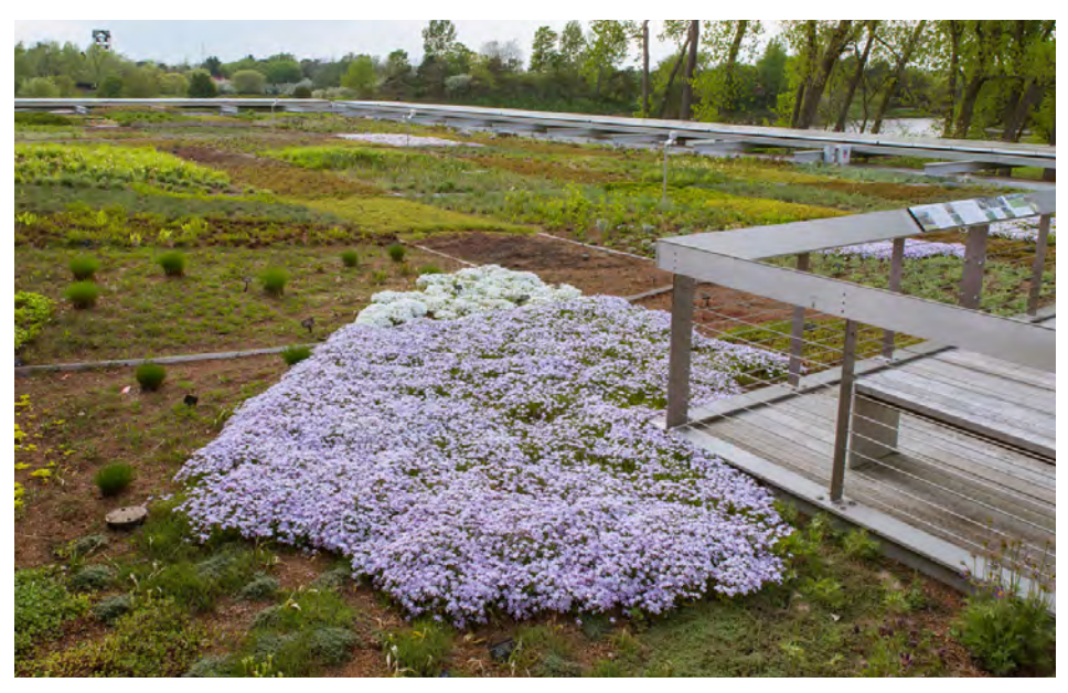
Phlox subulata 'Emerald Blue'

All plants were evaluated for their 1) cultural adaptability to the growing medium and environmental conditions on the green roof; 2) disease and pest problems; 3) winter hardiness or survivability; and 4) ornamental qualities associated with flowers, foliage, and plant habit. In addition, plants were monitored for reseeding and weediness. Final performance ratings are based on plant health and vigor, survivability and longevity, habit quality and flower production,