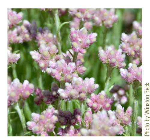
Antennaria dioica floral detail

equivalent of comparing apples to oranges. Instead, taxa were evaluated independently rather than comparatively unless a specific taxon was replicated in more than one location, more than one species in a genus was present, or plants had a similar life form, such as grasses. Although the majority of taxa were grown in just one location, 77 taxa were planted in two or more grow-