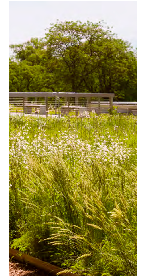
Koeleria macrantha and Penstemon digitalis