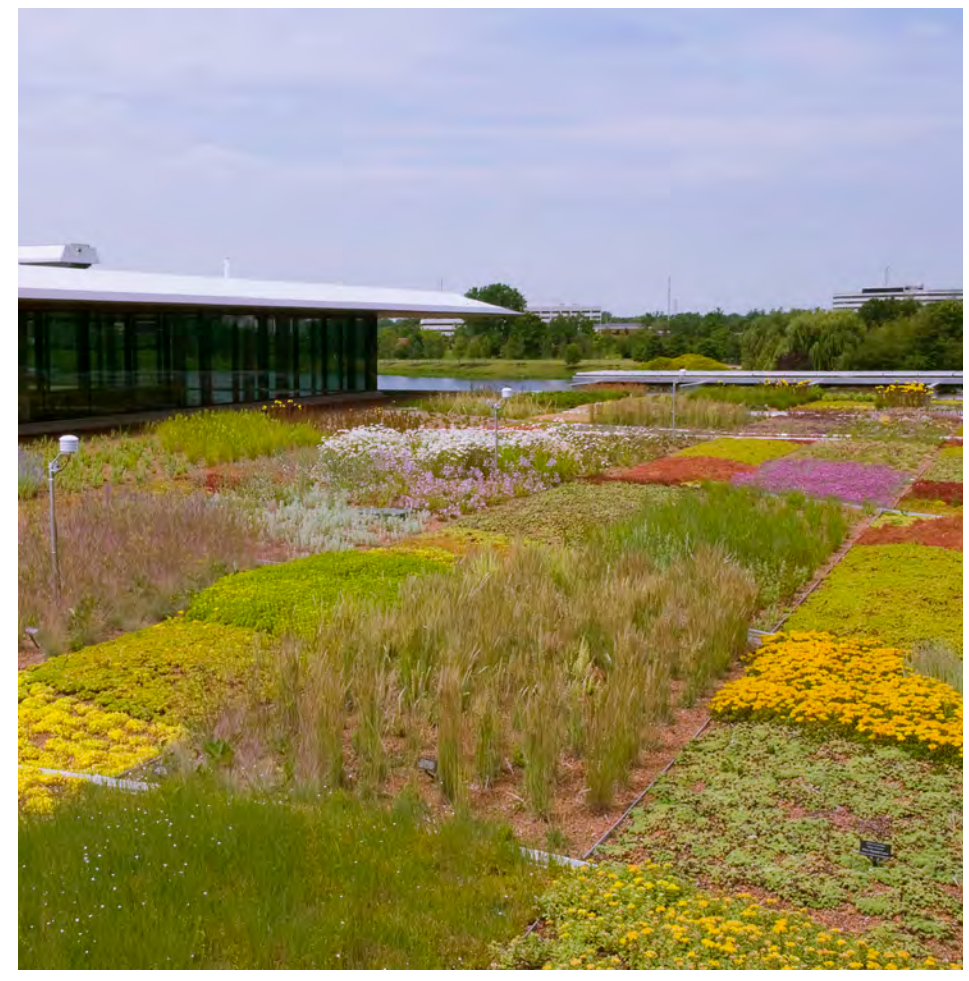
North green roof

In September 2009, the Chicago Botanic Garden opened its Daniel F. and Ada L. Rice Plant Conservation Science Center, a 38,000-square-foot LEED Gold-rated research and laboratory facility designed by Booth Hansen, a Chicago-based architectural firm. Atop the Center is a 16,000-square-foot green roof, divided into two 8,000-square-foot gardens that display a variety of North American native plants and exotic plants from around the world. The Green Roof Garden of the Chicago Botanic Garden consists of the Josephine P. & John J. Louis Foundation Green Roof Garden North and the Ellis Goodman Family Foundation Green Roof Garden South. The Green Roof Garden is both a living laboratory and a beautifully designed garden enjoyed by visitors year-round.