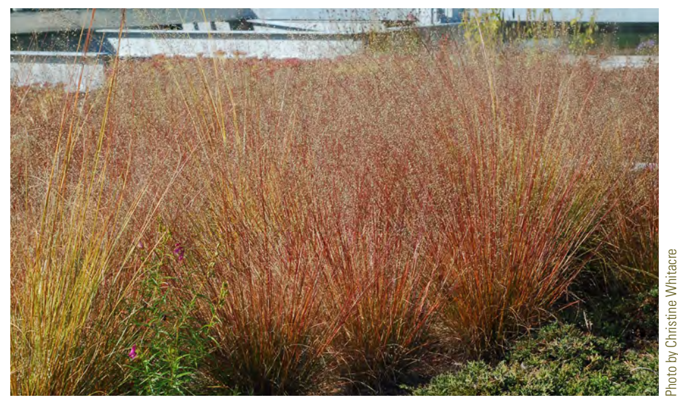
Fall color on Sporobolus heterolepis 'Tara'

from insignificant to severe infestations depending on the year. The chrysanthemum lace bug (Corythucha marmorata) attacks a variety of ornamental plants in the Aster family, such as chrysanthemums, asters, goldenrods, sunflowers, and black-eyed Susans, and was by far the most significant pest issue for Ratibida pinnata, Solidago rigida, Symphyotrichum ericoides, S. novae -angliae, and S. oolentangiense.