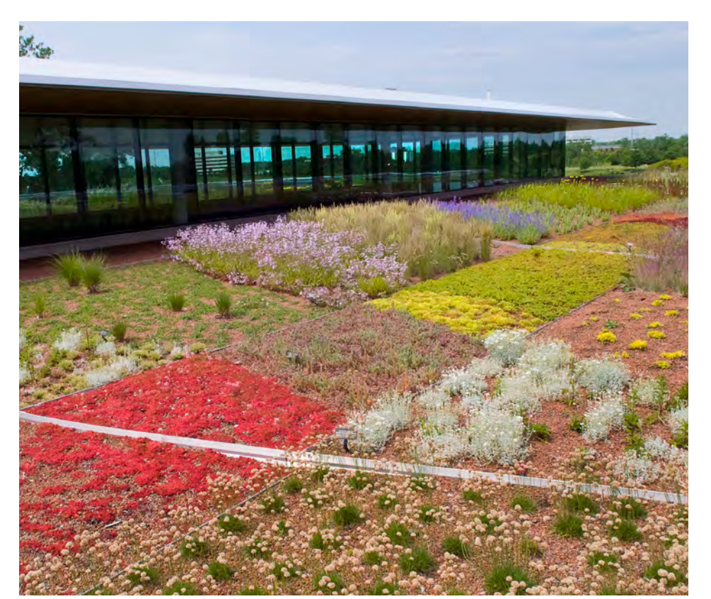
Sedum strip on north green roof

green roof a pleasing patchwork appearance that from the beginning appealed to visitors.