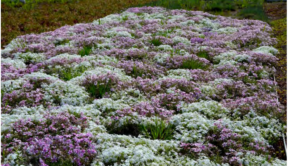
Phlox subulata 'Snowflake' and 'Apple Blossom'

A plant's habit determines its usefulness, whether planted en masse, combined with other plants, or used as an accent. Plant habits observed on the green roofs ranged from bushy to spindly and mat-forming to spreading. Consistently strong bushy habits were observed on Amorpha canescens, Andropogon gerardii, Calamintha nepeta ssp. nepeta, Ceanothus americanus, Coreopsis lanceolata, Dalea candida, D. purpurea, D. villosa, Dianthus gratianopolitanus 'Firewitch', Festuca amethystina 'Superba', Galium verum, Heuchera richardsonii, Hosta lancifolia, Hylotelephium 'Rosy Glow', Juniperus chinensis var. sargentii 'Viridis', J. hortizonalis 'Wiltonii', Koeleria glauca, K. macrantha, Nepeta