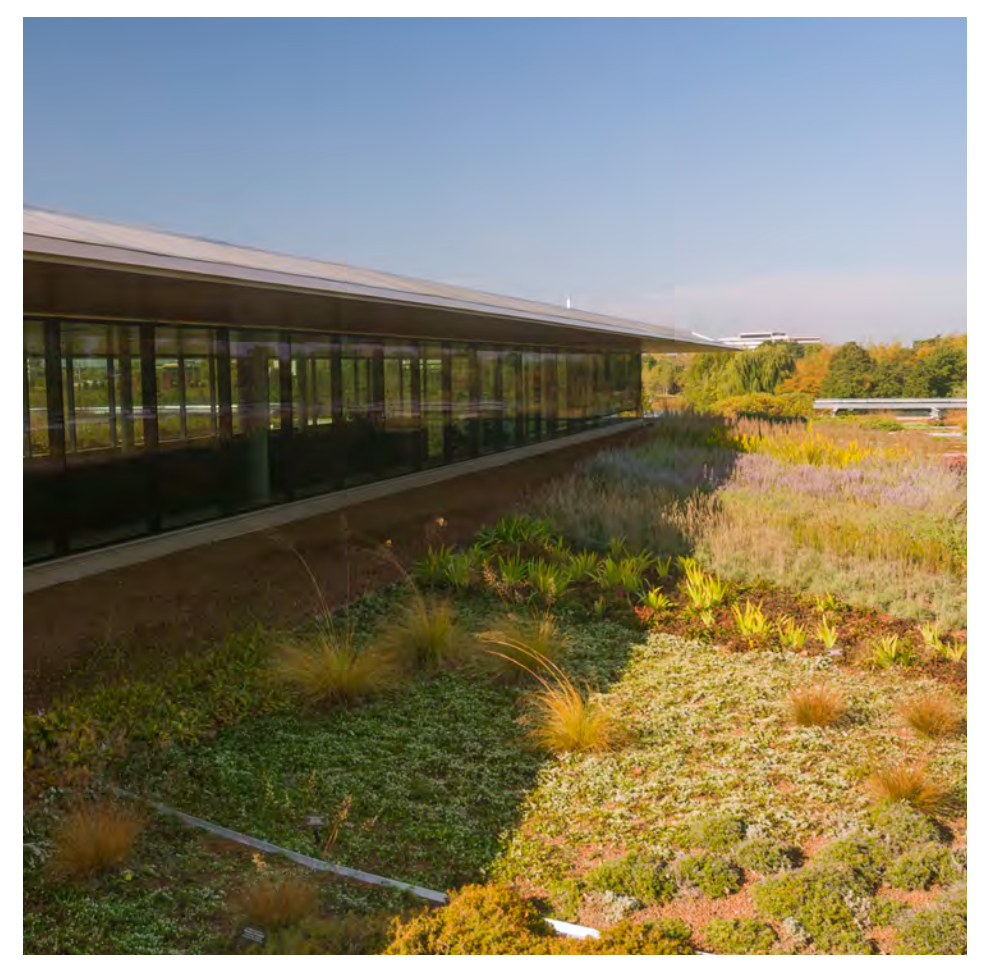
Shadow line on north green roof in late summer-early fall

Unlike a typical comparative trial undertaken at the Chicago Botanic Garden, the broad diversity of the plant list was the