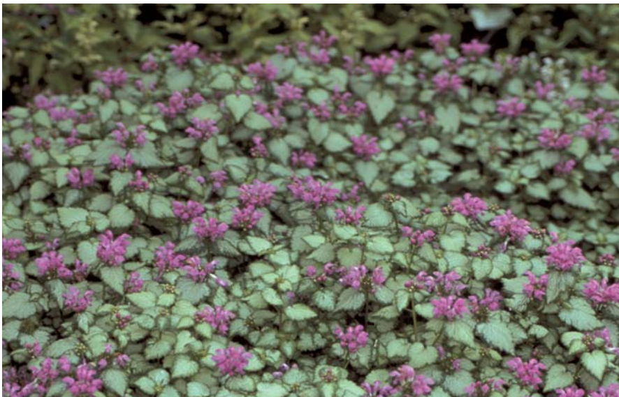
Lamium maculatum 'Red Nancy'

Regardless of differences in foliage and habit type, all dead nettles share the same