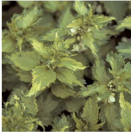
Lamium album 'Friday'

Though they are tough garden plants, dead nettles are not entirely maintenance free. A high level of promiscuity leads to large numbers of seedlings annually, and without some attention to weeding and maintenance, new seedlings may overtake the original plants. Lamium cultivars do not remain true from seed; therefore, seedlings should be removed to maintain the integrity of the cultivars that were originally planted. Seedlings of L. maculatum are easy to spot among the silver- and yellow-leaved varieties, since the true species has green leaves with a silver stripe. Weeding out seedlings among silver-striped varieties can prove more challenging, as it requires proper identification using flower color or subtle variations in leaf traits to distinguish differences.