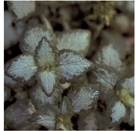
Lamium maculatum 'White Nancy'