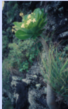
Fig 1: Brighamia insignis growing on the cliffs of Hawai'i.

The genus Brighamia is composed of two morphologically similar species B. insignis (Fig 1) and B. rockii , which are long-lived perennial members of the family Campanulaceae. Both Brighamia species are halophytic, sea-cliff dwelling, succulent plants (Gemmill, et al. 1998). The morphological features of Brighamia make it taxonomically unique (Lammers, 1989). One of their most distinguishing features is a large swollen unbranched stem which tapers toward the apex, supporting a crown of tightly packed leaves and auxiliary inflorescences of erect flowers (Lammers, 1989). Mature plants usually reach between 1-2.5 meters in height but have been known to grow in excess of 5 meters (Rock, 1919).