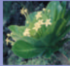
Brighamia insignis

1 Lake Forest College, Lake Forest IL, 60045, 2 Chicago Botanic Garden, Glencoe IL, 60022