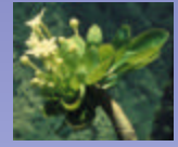
Brighamia rockii