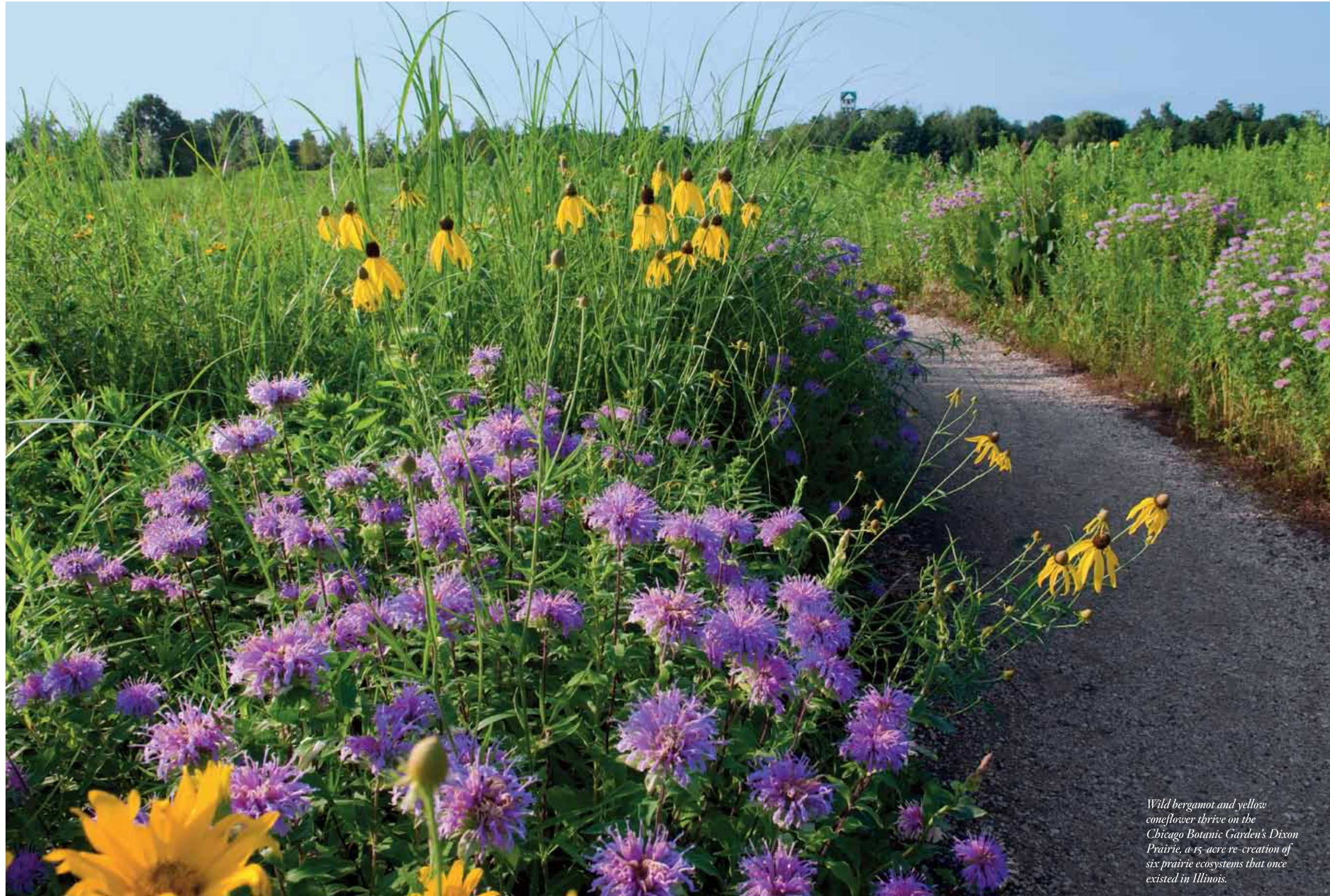
Wild bergamot and yellow coneflower thrive on the Chicago Botanic Garden's Dixon Prairie, a 15-acre re-creation of six prairie ecosystems that once existed in Illinois.