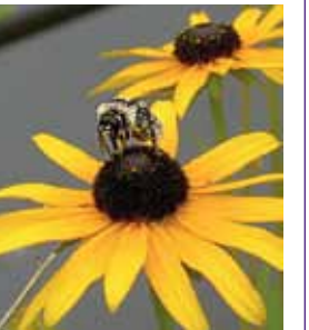
A bumblebee lives the high life on a rooftop garden.

“The study is a way to show green space utilized by native species of bees. The city’s not uninhabitable, and it gives them options for places to be. Urban green space that’s not turf grass is exciting.” As for the apparent downsides of her job, she’s been “stung in the past, but never on this project.” — Kent Cabbage