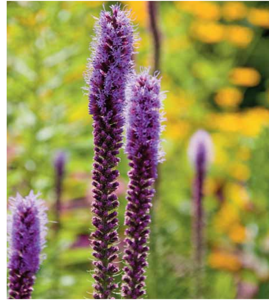
Blazing star, Dixon Prairie, Chicago Botanic Garden