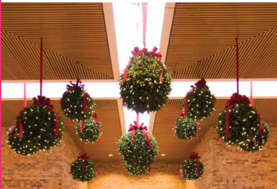
Create a smaller version of the boxwood kissing ball displayed at Wonderland Express.

Visit www.chicagobotanic.org/school/faculty for faculty biographies.