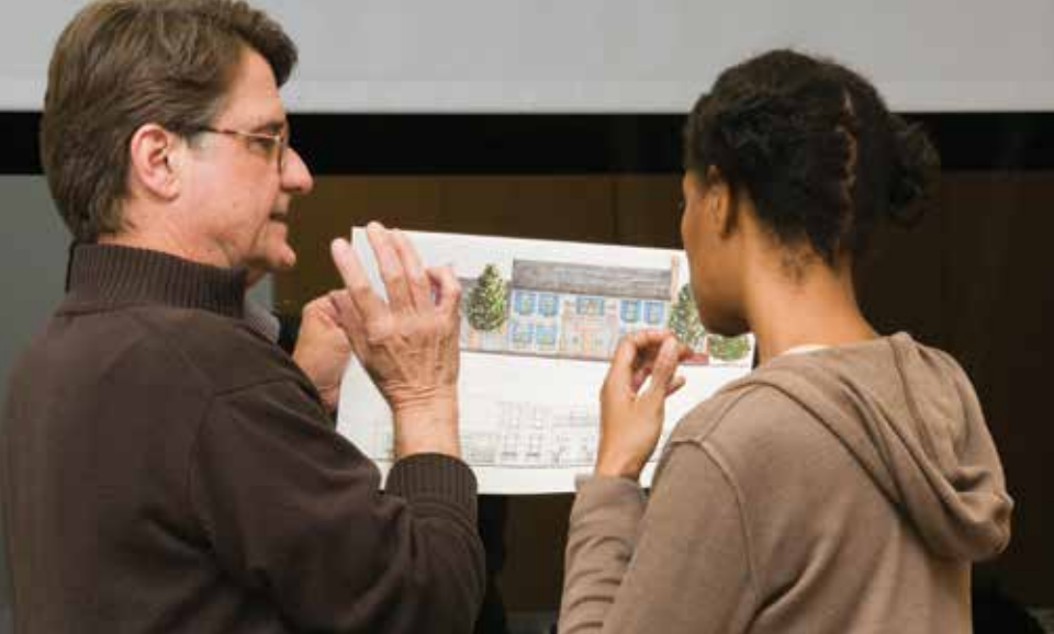
Garden Design students work closely with expert faculty.