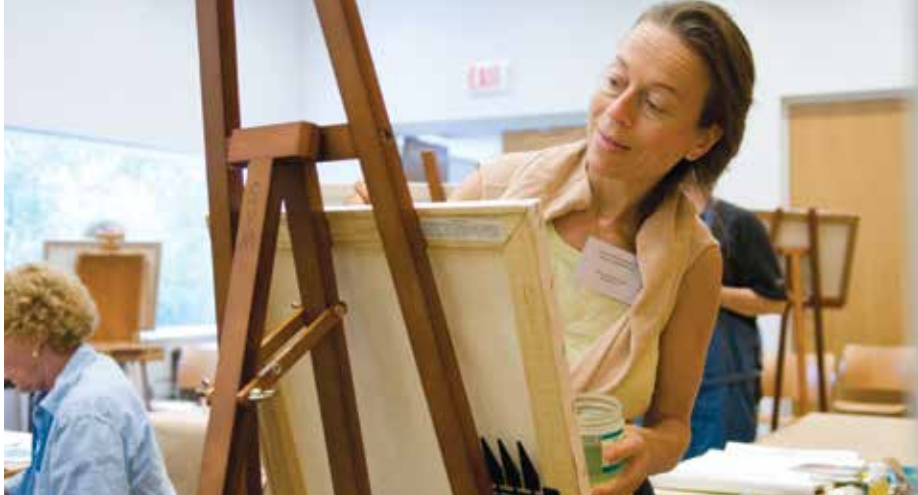
Botanical Arts classes allow students to explore and improve their techniques.

Adult Education Free Information Session, Monday, March 4, 6 – 8 p.m. Call (847) 835-8261 to register.