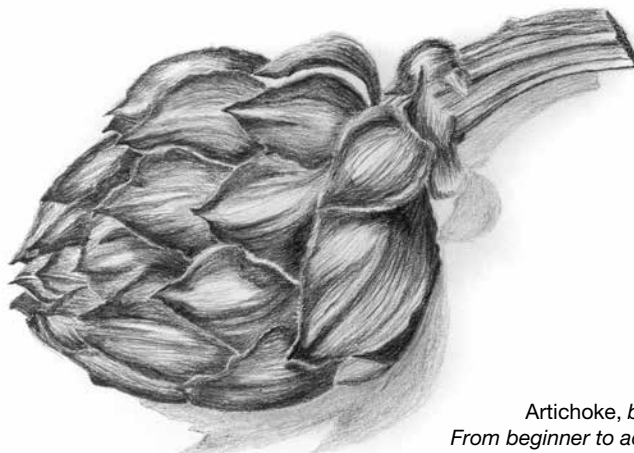
Artichoke, by Pepper Werner. From beginner to advanced, all levels are welcome in the Botanical Art certificate program.

Classes are subject to change. For the most current listings visit www.chicagobotanic.org/school .