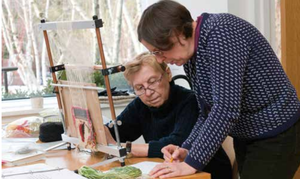
Students learn frame-loom weaving skills.

Inspired by the little treasures you save and love, we will cleverly combine old and new elements to create spectacular jewelry. Bring your special and sentimental keepsakes, single earrings, buttons, charms, chains, family photos, and found objects and let Bonnie Arkin inspire your creativity. We can create wonderful new designs from vintage treasures. You will learn to solder, wire wrap, and string. Arkin has many examples to share and resources for treasure hunting. A supply list will be sent.