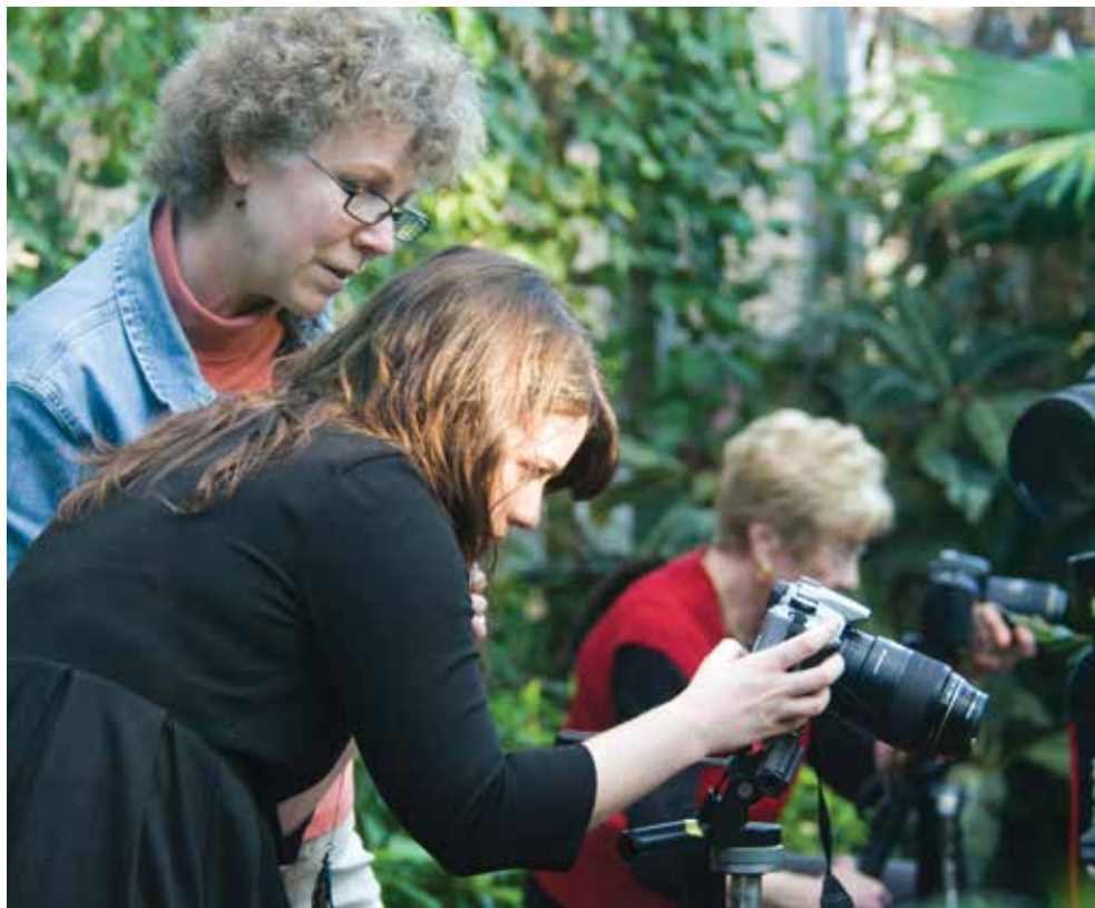
Master photography skills in the Garden's newest certificate program.

Adult Education Free Information Session, Monday, March 4, 6 – 8 p.m. Call (847) 835-8261 to register.