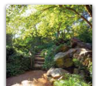
A Day in the Shade

5 Wednesdays, July 9 - August 6 See page 67.