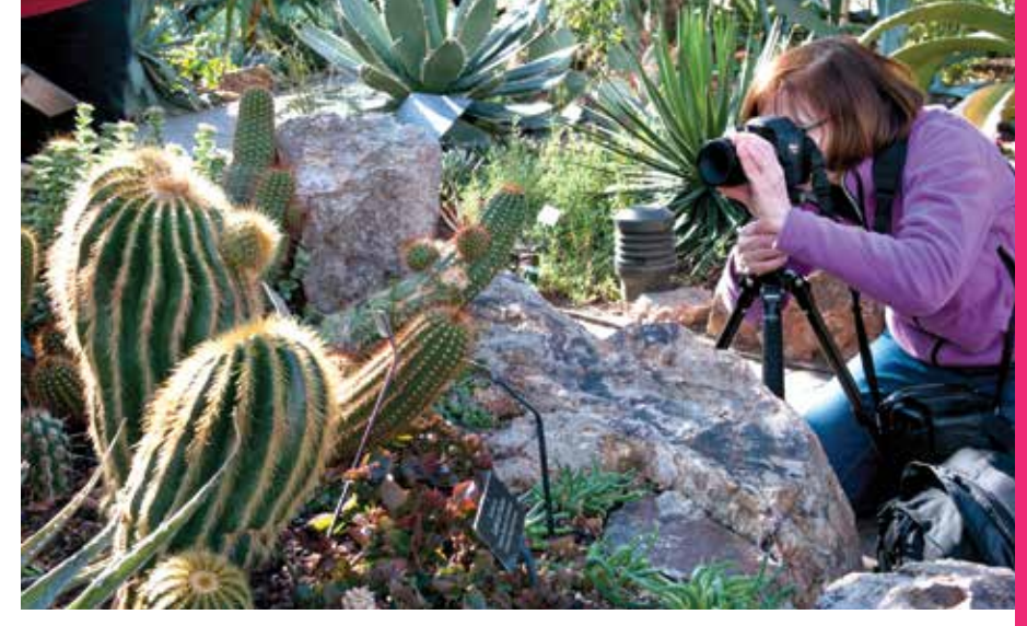
Expand your photography skills while discovering the Garden.

You do not need to pursue a certificate to participate in these courses unless a prerequisite is listed.