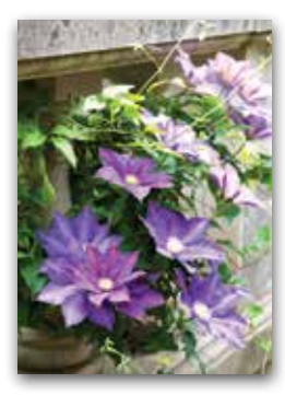
Clematis Up Close Saturday, March 30 See page 48.

Thursday, March 14, and Friday, March 15 See page 54.