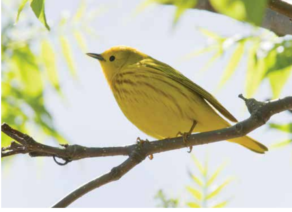
Learn to identify different migratory warblers in Warblers for Beginners.

Chicago Botanic Garden members receive a 20 percent discount on classes.