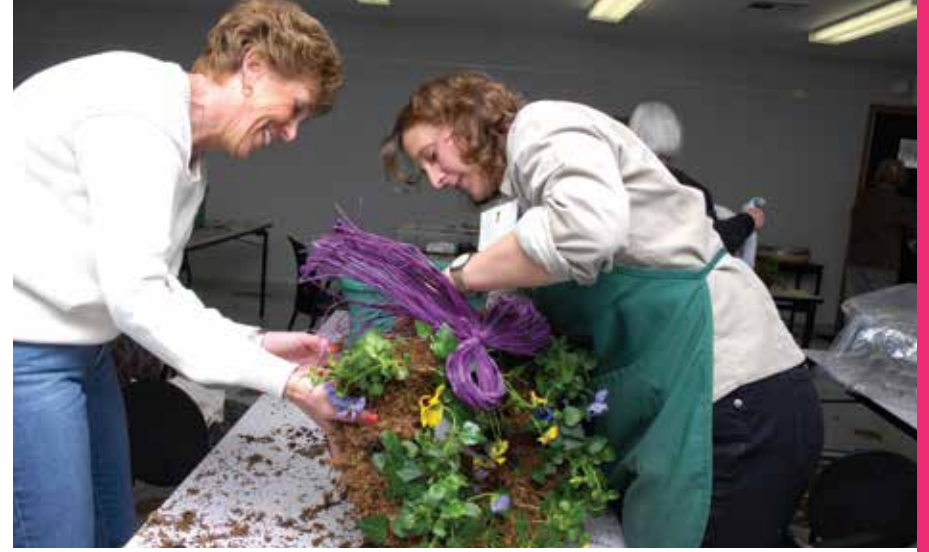
Join in the fun at a pansy wreath workshop!

Chicago Botanic Garden members receive a 20 percent discount on classes.