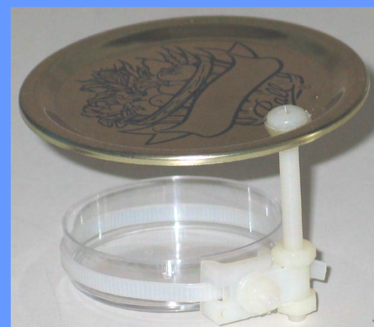
Lid/Petri Dish Apparatus