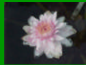
Figure 3a: V. cruziana second day flower