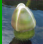
Figure 1a: V. cruziana bud