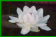
Figure 2b: V. amazonica first day flower