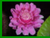
Figure 3b: V. amazonica second day flower