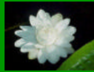
Figure 2a: V. cruziana first day flower