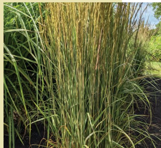
'Lightning Strike' feather reed grass

if it hadn't been sitting among the taller reed grasses, where the obvious differences between them sparked curiosity.