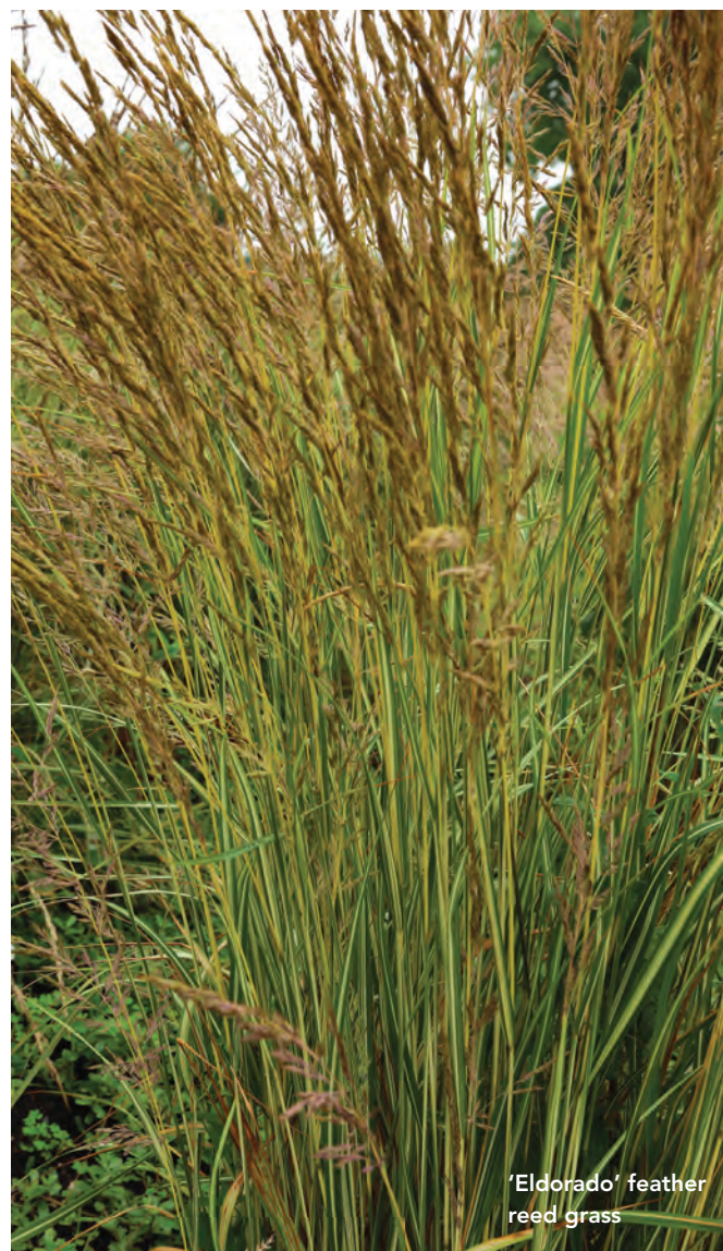
‘Eldorado’ feather reed grass

I cannot remember if I voted for ‘Karl Foerster’ feather reed grass for Perennial Plant of the Year in 2001, but I think that everyone who did got it right. The narrow, vertical habit remains neat all season, although by midsummer the slender bright green leaves arch fountainlike under the upright floral stalks. Golden seed heads are its most recognizable trait—the flower stalks make up about two-thirds of the nearly 6-foot height—but the flowers start out silvery purple and feathery before constricting into the slender plumes. The progression of colors on ‘Karl Foerster’ flowerheads may be subtle, but if you look for it you’ll see the transition from purple-pink to