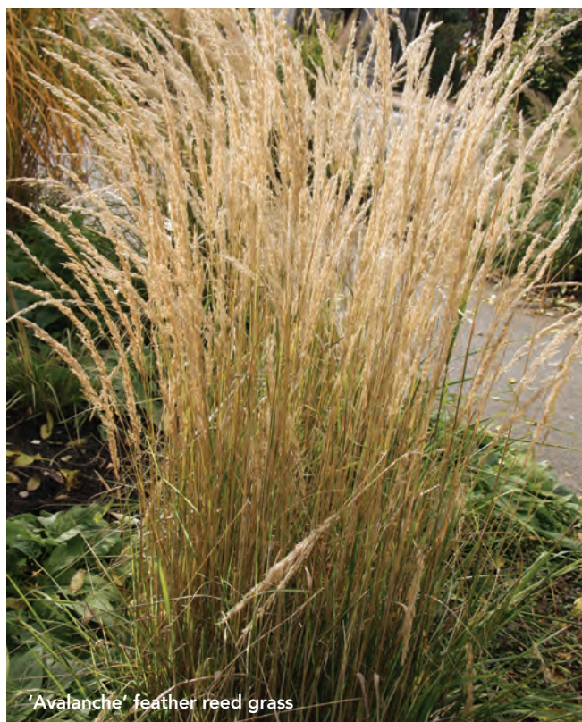
'Avalanche' feather reed grass