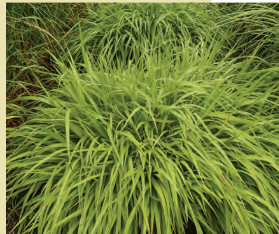
'Cheju-do' reed grass

I knew nothing about ' Cheju-do' reed grass ( C. 'Cheju-do' , Zones 5–8) when I bought it except that some descriptions likened it to a dwarf 'Karl Foerster'. I still don't know its parentage, but now that I've grown it, that depiction seems a stretch to me. It's like saying a dachshund is a small version of a greyhound. The shorter, mounded habit of 'Cheju-do' is a pleasing departure from the upright forms. Soft silvery hairs on the light green blades sparkle on sunny days and on dewy mornings. Short pink-and-green plumes are 6 inches long and 1 inch wide (they constrict to ¼ inch wide) and are not as fluffy as those of Korean feather reed grass. They open in midsummer and ripen golden tan on russet-toned culms in fall. The leaves take on bronze hues in fall too. I do wonder if 'Cheju-do' would have gotten as much visitor attention