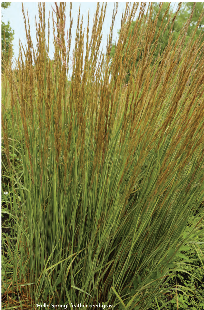
'Hello Spring' feather reed grass